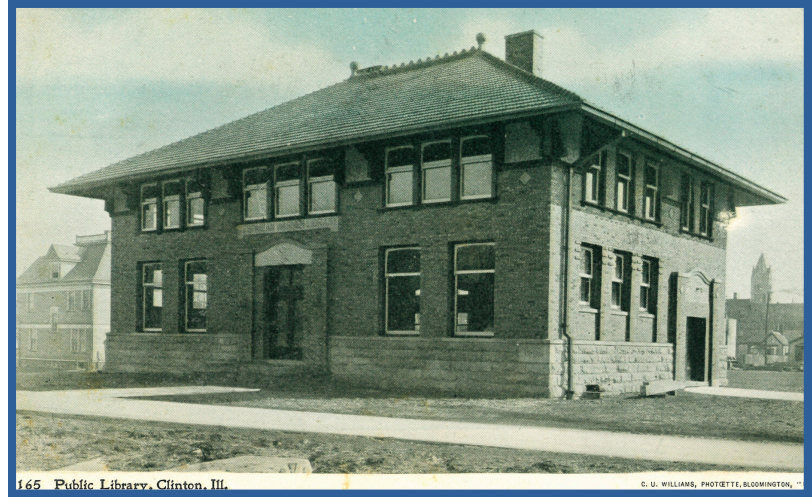
Vespasian Warner Library, ca. 1908

VWPLD is deeply rooted in DeWitt County and provides a significant historic presence for library district residents and beyond. The legacy of the members of the Moore and Warner families is widely known, and many institutions have benefitted from their generosity. The physical library is unique, a building within a building, which features Arts and Crafts architecture and decorative arts. The library houses many historic documents and items and serves as the home of the DeWitt County local history collection.